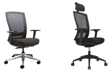
Featured with arms