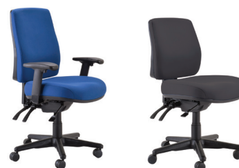
Roma 3L High back, with arms