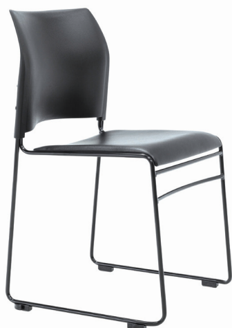
Maxim Black - Black Powder Coat Frame