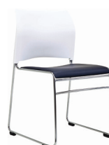
Maxim White - Chrome Frame