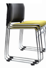
Maxim Black - Chrome Frame with Custom Seat