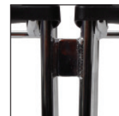
Maxim with heavy-duty linking system (Indent only)