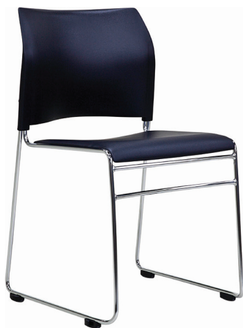
Maxim Black - Chrome Frame