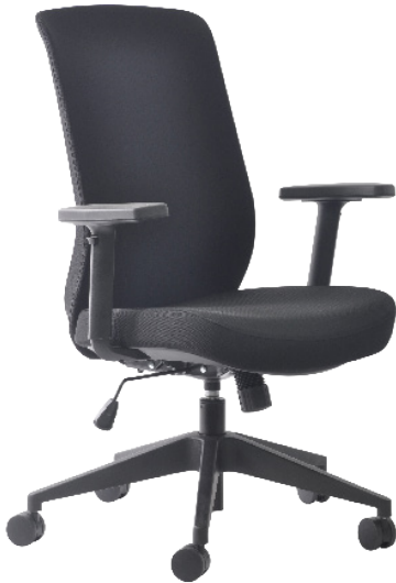
Mondo Gene (Black fabric back)