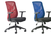
Mondo Gene Mesh Back (Red, Blue)