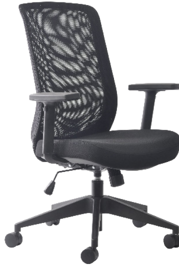
Mondo Gene (Black mesh back)