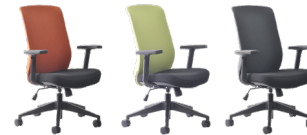
Mondo Gene Fabric Back (Orange, Green, Grey)