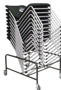
Mario stacked on trolley