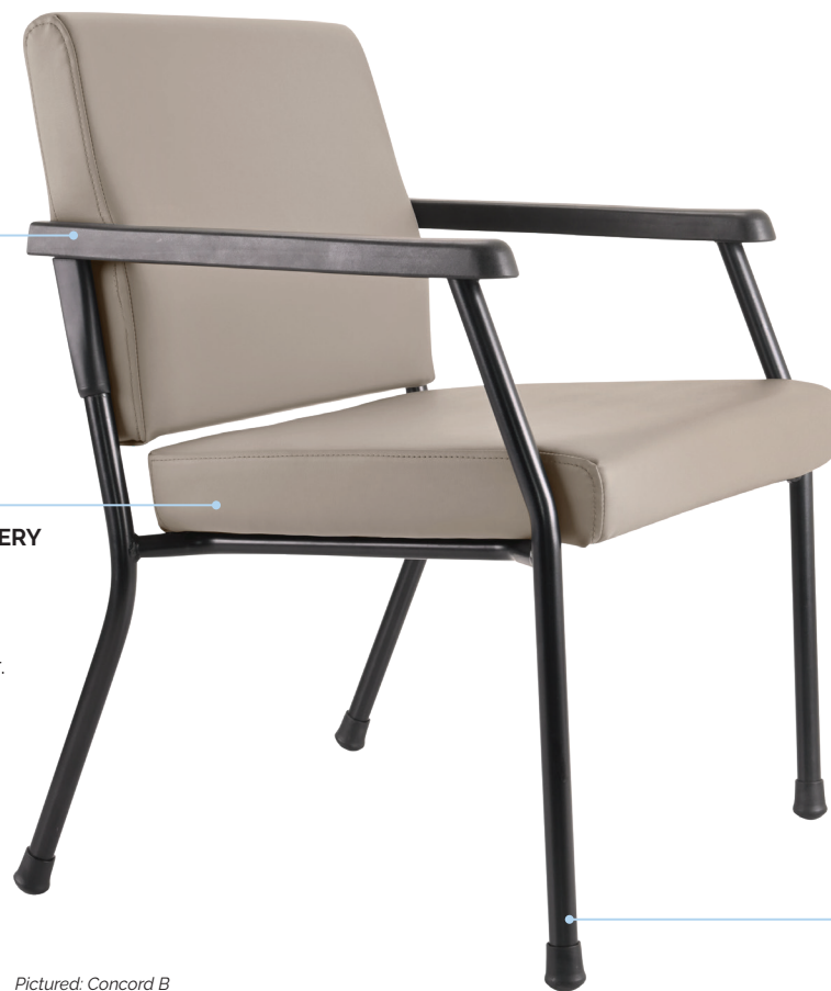
Pictured: Concord B

ANTI-MICROBIAL UPHOLSTERY Dillon PU is a heavy-duty fabric with Silver-based Ion Technology, designed to withstand high wear and tear.