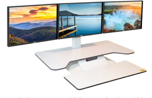
standesk pro memory with 3 monitor bracket—White