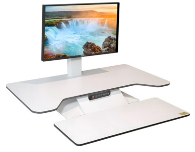
Please note: the monitor is not included.

standesk pro memory has 2 larger work surfaces, one for the keyboard and mouse and the other a large and generous desk area to accommodate your monitor, or your laptop. Standesk pro memory has infinite height settings for any height you may desire and is adjustable automatically in seconds!!